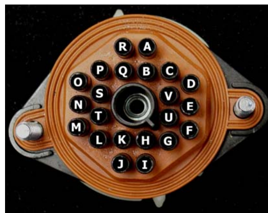
PIN LOCATIONS TWR

Either side of connector can use male or female terminals. WEATHERPACK CRIMP TOOL (Caspers PN 103021) IS RECOMMENDED to stake terminals and seals. Use cavity plugs (not included in kit) in any unused cavities when not filling all 22 cavities. Use gray seals for 14-12 gage wire, yellow seals for 18-16 gage wire. The 18-16 gage terminals included in this kit are smaller in the crimp area than the 14-12 gage terminals. Cavity plugs, if needed, are available at any NAPA auto parts store or your local GM dealer.