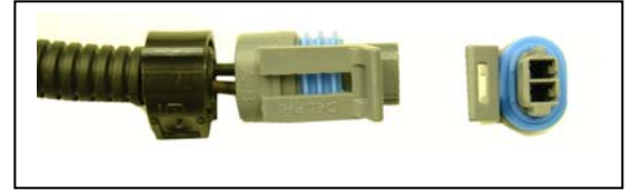
109022 (12") 109023 (24") GM 1994-up 3-wire MAF extension