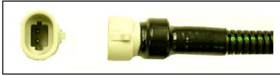
109017 (12") 109018 (24") GM Style Airtemp Sensor extension

Relocating or installing upgraded or accessory devices, such as Airfuel Ratio gauges, throttle bodies, mass airflow sensors, MAP sensors and air temperature sensors require extended or accessory tap wiring. Because it is not practical or safe to cut wiring to these devices, using these "plug-and-play" extensions makes installation of the device a snap. Quality construction using OEM connectors, seals, wiring, and conduit makes these extensions the best and most reliable products available.